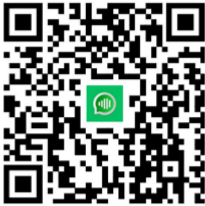
Apple iOS User

Download the App: Search for the "One-Click Translate" app on the Apple App Store or Google Play, or scan the provided QR code to download and install the app.